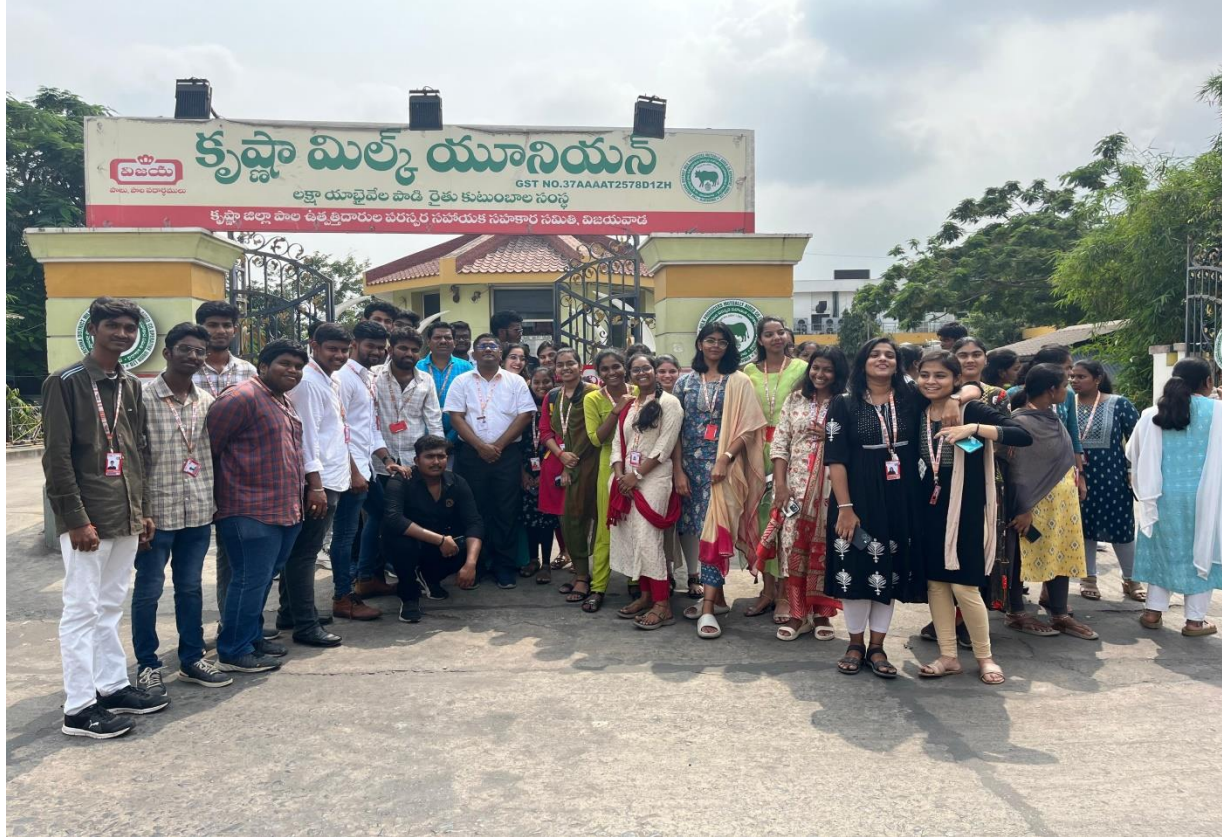
Picks of Industrial Visit